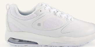
Revolution II White: 28093